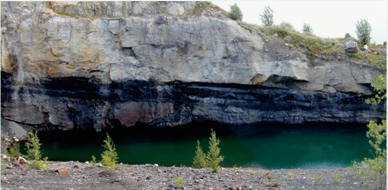
(top) Lignite coal seam in Eocene upper Bonnet Plume Formation, Peel River, Yukon. (bottom) Upper Coal seam at the formerly producing Whiskey Lake open-pit coal mine.