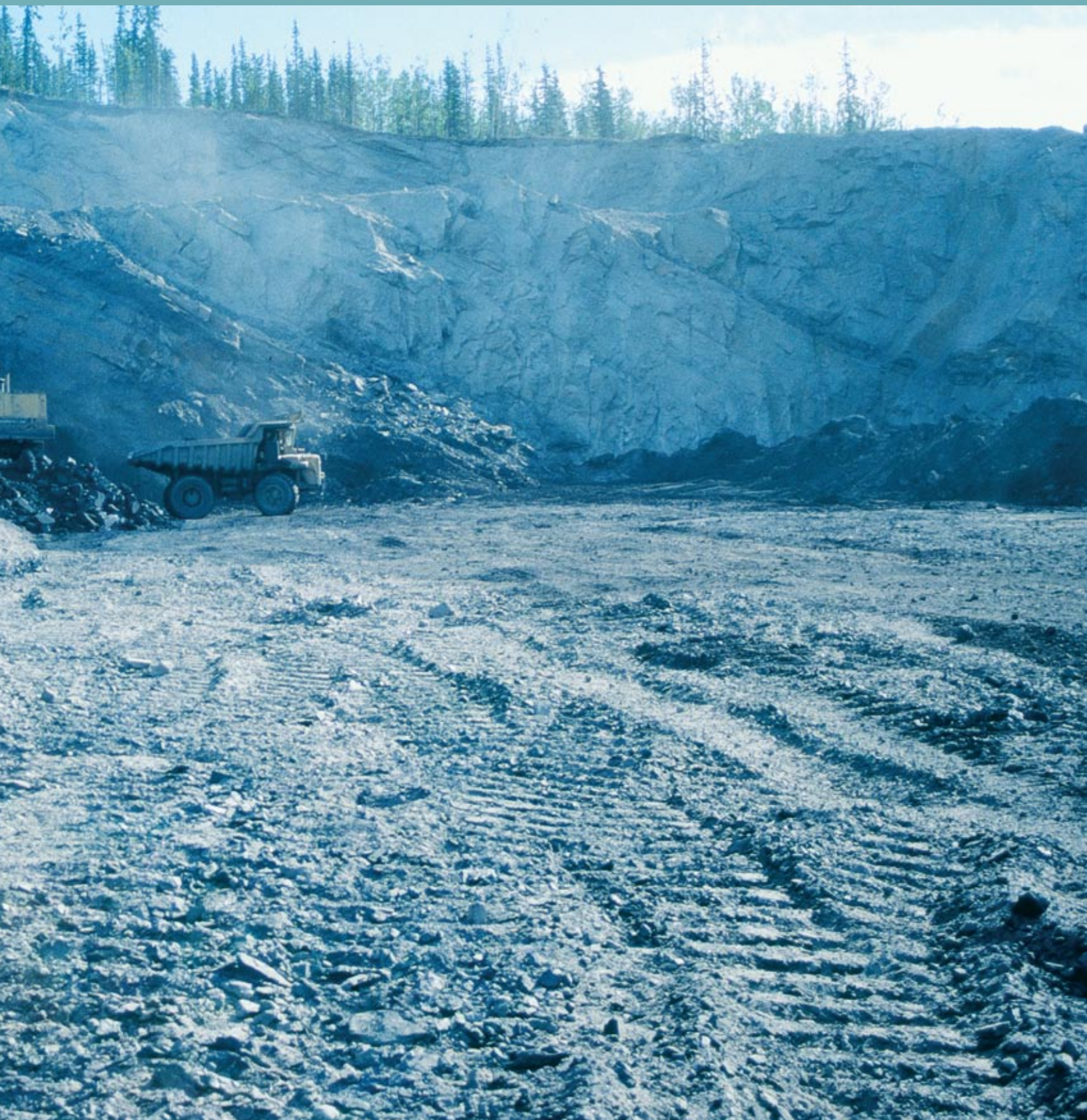
Coal mining in 1992 by Nadahinni Mining on the Whiskey Lake deposit near Ross River. This coal was being mined from Cretaceous to Eocene conglomerates along the Tintina Fault. It was used for plant heating and concentrate drying at the Anvil Mine.