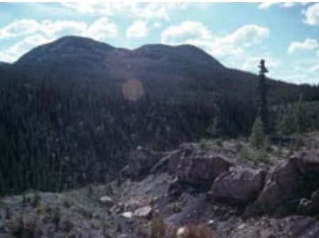
Typical exposure of the coal-bearing Tanglefoot formation, east of Carmacks. (above) Discovery outcrop at the Division Mountain coal deposit which occurs in the upper Tanglefoot formation within the Whitehorse Trough.

Coal is confined to an area approximately 10 by 50 km, and is mostly concealed by a mantle of clay, gravel and sand, locally up to 30 m thick. Based on five drill holes totalling 720 m, there appears to be approximately